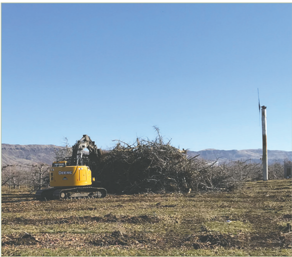
The Maintenance Department is happy to report the land for the New Transportation Department on the corner of Grant Road and N. Perry has been cleared of trees.

Our upcoming projects to add 20 classrooms, four cafeterias, repair a roof at Clovis Point and replace the EHS baseball field concession building and restrooms are in the planning stages. These projects will go out to bid during the 2018-19 school year. Ideally, we will break ground early 2019 and be completed by August 2020. Our new transportation facility at the corner of Grant Road and Perry continues through the permitting process and still needs final confirmation of grant funds before we proceed any further.