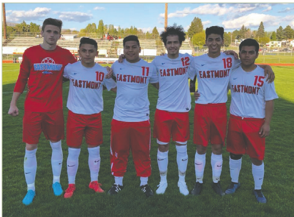
The 2018 season has been a big one for the EHS soccer squad. They are ranked fifth in the state, with an overall record of 12-3.

EHS soccer celebrated its seniors recently, as well as the families that support these talented players. Thank you for all your hours of commitment to Eastmont and your sport. You are leaving a wonderful legacy.