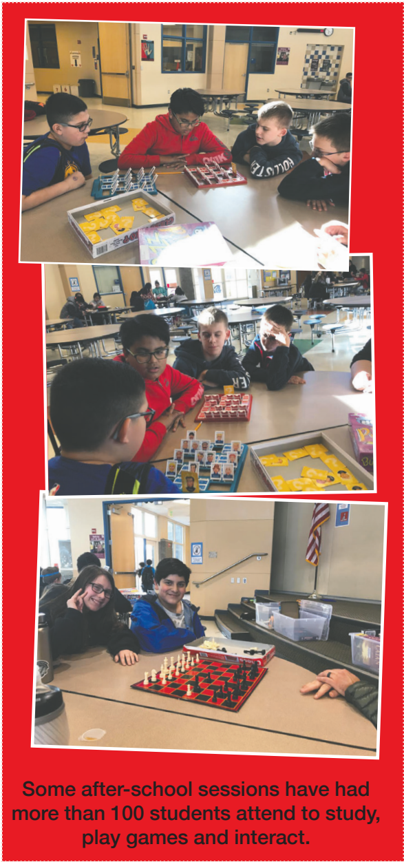
Some after-school sessions have had more than 100 students attend to study, play games and interact.

“It’s been a real team effort,” she said. “It makes me feel good to know kids have somewhere to go after school.”